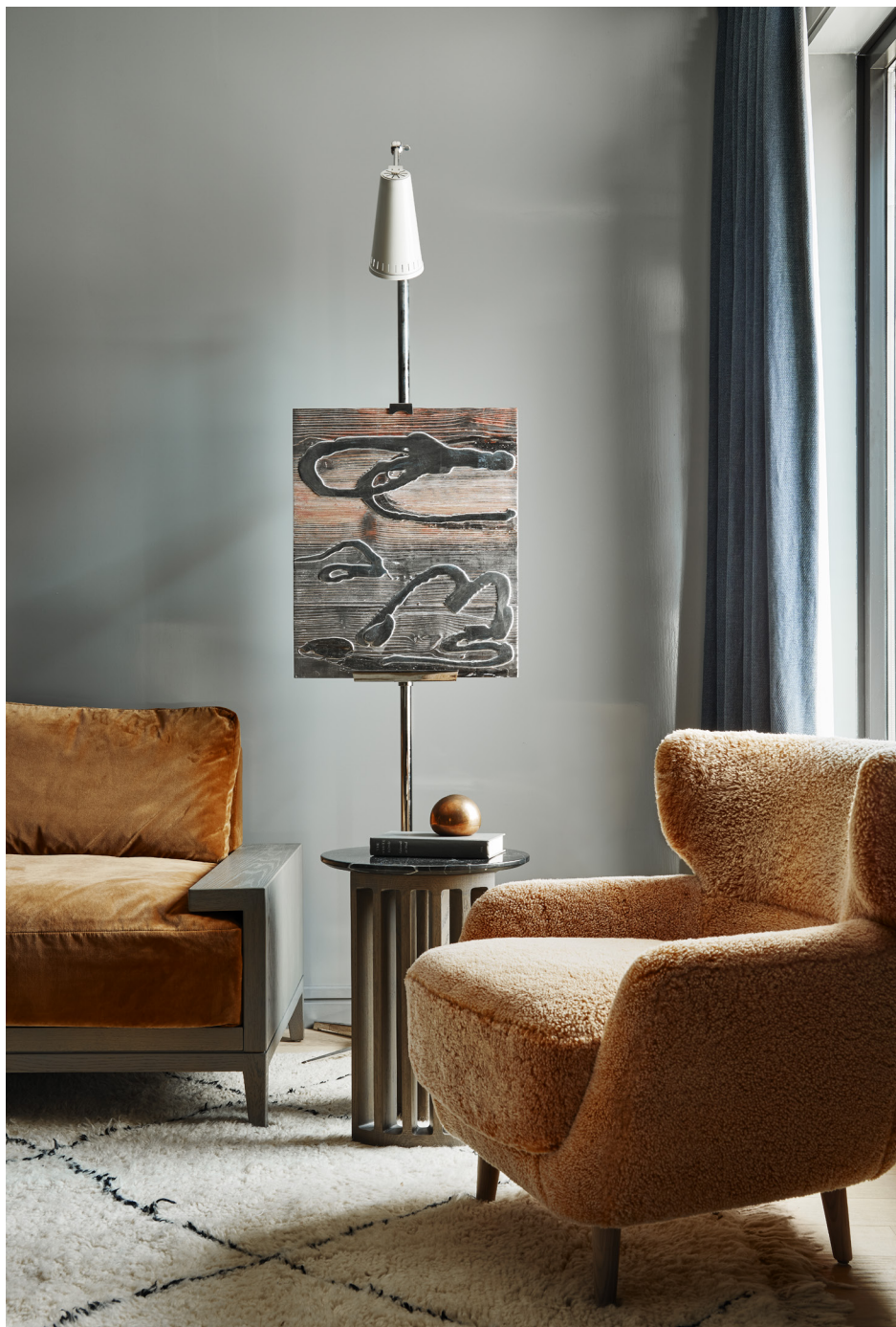
Shown in Gray Oak and Nero Marquina Marble